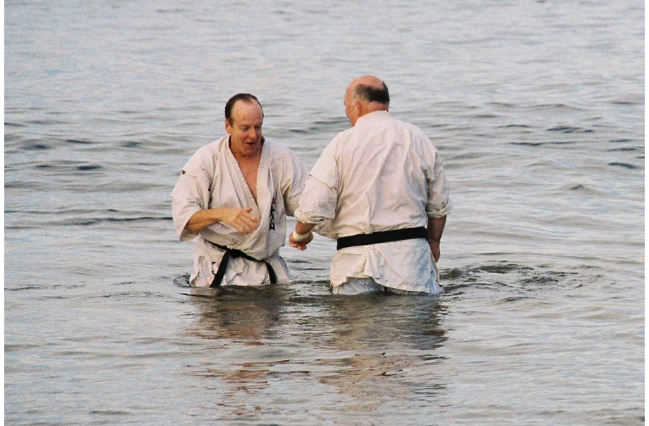
Battle in the water, or making plans for breakfast ?

Whenever you train outside of the dojo, at the beach, the mountains, somewhere like that, you become refreshed, and can appreciate all kinds of things. At Summer Camp, we start training before sunrise, just as the