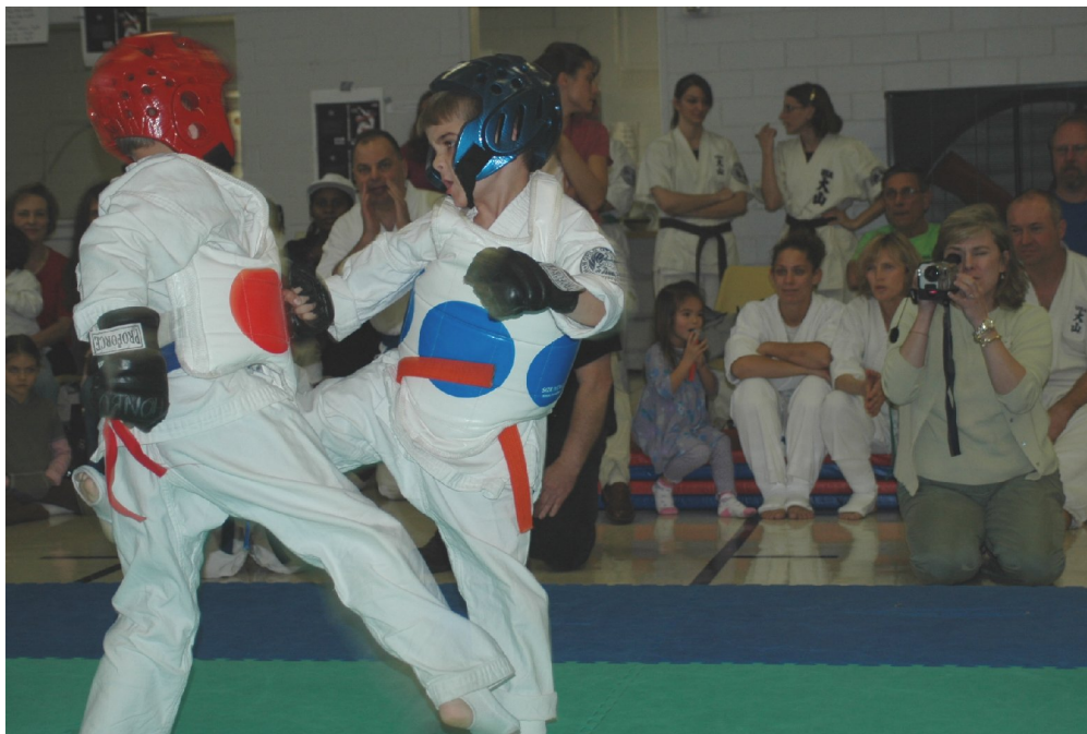
Two real warriors... and mom

with different people. But what sticks out in my mind most is the crowd of children that chanted his name whenever he fought. These were kids that he had trained with during his stay. At that moment, I felt strongly how World Oyama Karate is for everyone . Young, old, men, women—everyone can gain something from training. I hope you all can make it to Japan next year. The 2008 Japan Cup will be held on November 16, 2008 .