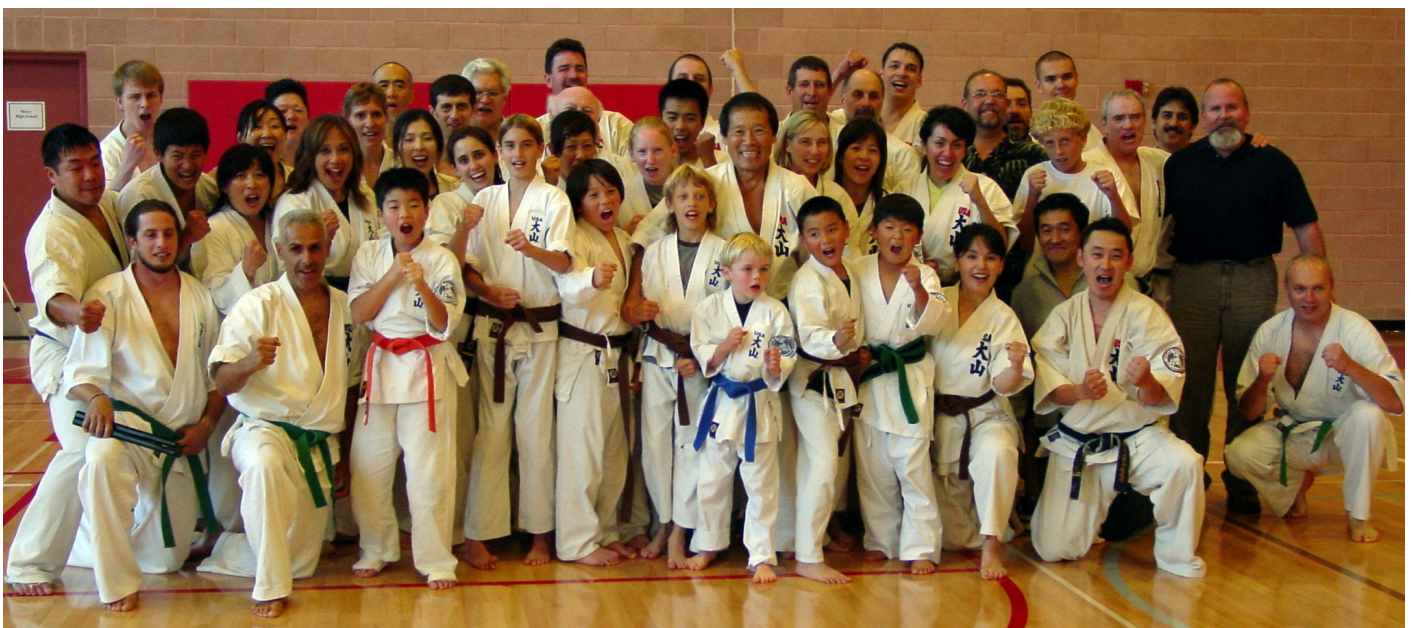
Another great turn out for 2007 Fighter's Cup

last bit of night is fading away. We jog a couple miles, then sit and meditate in front of the waves. The sun slowly begins to rise, and students close their eyes, focusing on the ocean breeze and sound of rolling water against the sand. I watch the students as they meditate. Some of them look like they're about to snore. Others keep waving away insects flying in front of them. Still others look like they're really into it, really meditating, but I can read their thoughts: "Some eggs, bacon, and hot coffee would be so good right now." I can see their mouths twitch, trying to taste the images in their minds.