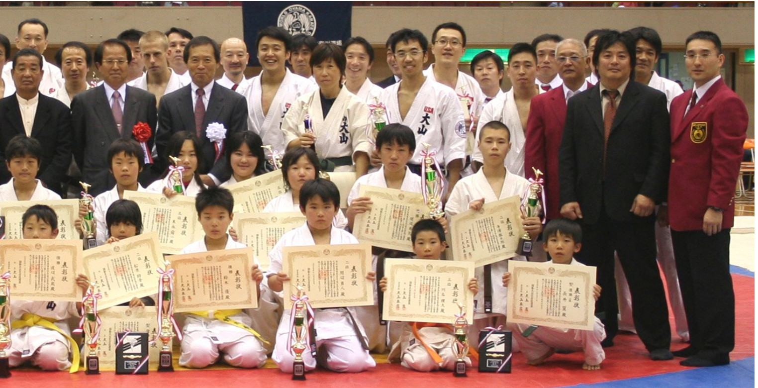
ni, Saiko Shihan, and Japan Cup Champions