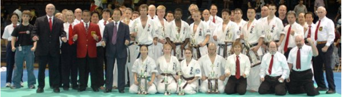
All participants enjoyed a successful 2007 American Cup

once. I understand that most students aren't planning on making a career out of training and competing. But the point is, are you going to step inside the room, or just keep looking from outside the door? Once you enter, you'll discover a whole new world—but you've got to take the first step. When you make up your mind to fight in a tournament, your training will be more focused. You'll have to fight yourself and build up your spirit. You'll have to fight against the temptation to look for an easy way out, but life is like that—great rewards require great effort.