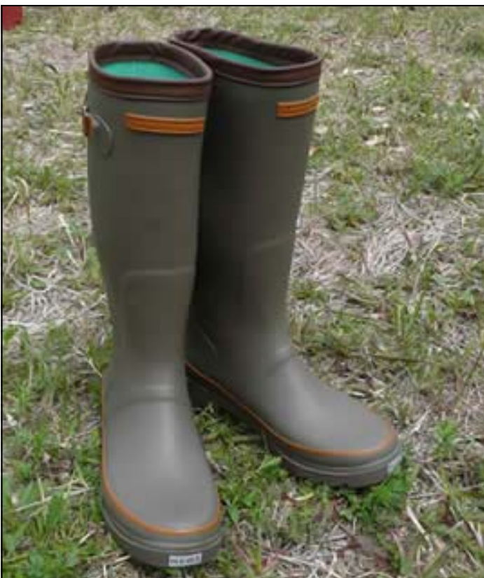
Nagagutsu—Hard to do roundhouse kick when wearing these!

We opened our eyes, and Mas Oyama stood up. I pulled myself to my feet as fast as I could and commanded everyone else to stand up. They all stood up, but since their legs were numb, many people collapsed back to the floor with a loud thud. Dunn! dunn... dunn-dunn... dunn dunn... dunn! They fell over, one after the other. Howard Collins fell to the floor,